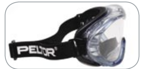
Available with Foam