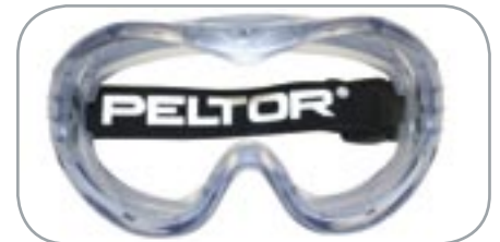
Soft PVC Frame