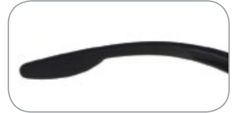
Sport Grip™ Temples