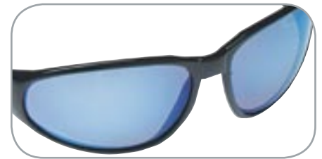
Moulded Nose Bridge