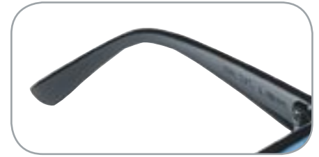
High Impact Nylon Temples