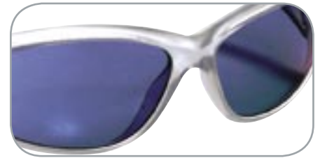
Moulded Nose Bridge