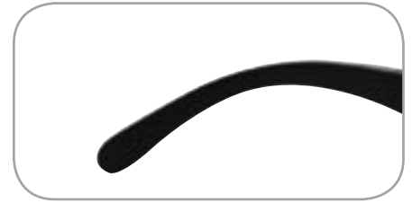
High Impact Nylon Temples